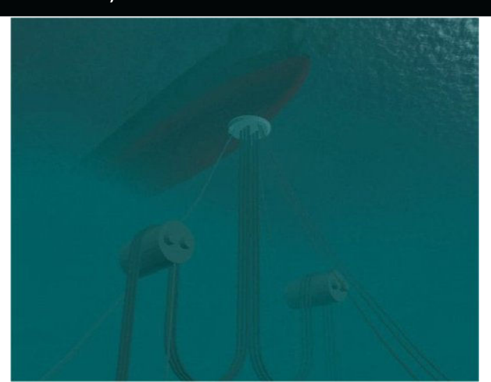
FPSO Subsea arrangement showing the risers entering the hull via the turret moonpool.

Meanwhile, the marine industry has quite a different problem. It is a requirement of the British flag that companies with UK registered ships must train a certain number of cadets - known as the tonnage tax. As the fleet of the British flag has increased in size in recent years the number of cadets in training has risen in parallel. However, job opportunities for the cadets at the end of training are limited as increasingly Ship owners and Managers turn to the cheaper labour markets of central Europe and the Far East.